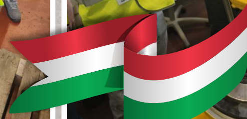
Rand Air technicians Dinkwanyane Dinkwanyane & Trevor Mpikwane recently underwent an intensive three-day pump training program at Atlas Copco Italy, meticulously designed to equip them with comprehensive knowledge and hands-on experience. The training was inclusive of theoretical insights and practical applications, offering a holistic understanding of pump systems. Both technicians delved into the intricacies of pump functionality, enhancing their expertise and proficiency in managing and maintaining these crucial components within Rand Air's operations.